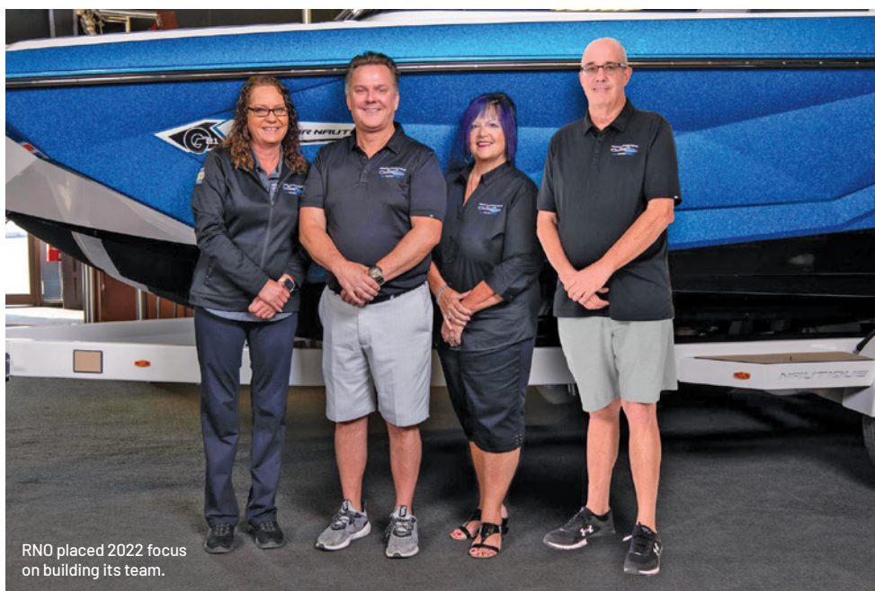
RNO placed 2022 focus on building its team.

First and foremost, for the RNO team is a list