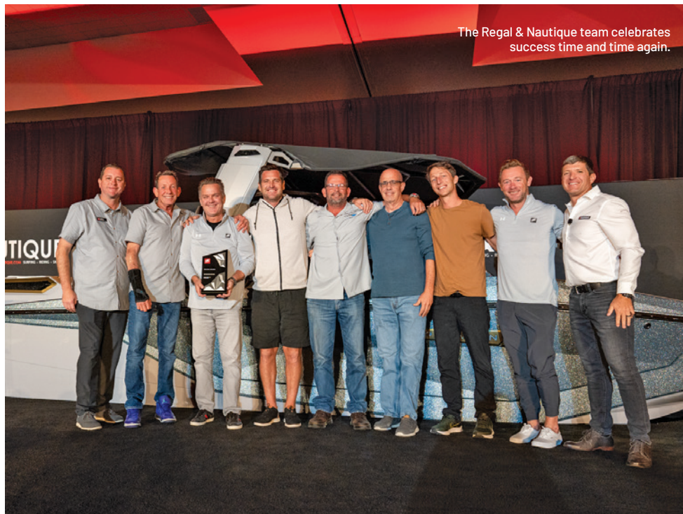
The Regal & Nautique team celebrates success time and time again.

“We clearly understood that this [earning a